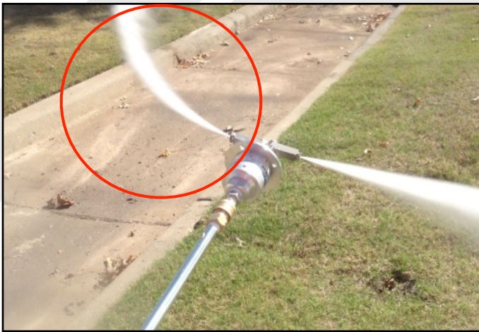
DRIPLOC HEAD RUNNING @300-500 R.P.M. SPRAY REACH

NOTICE LOWER R.P.M. SPRAY PATTERN ON THE LEFT REACHES OUT FURTHER THAN HIGH R.P.M. SPRAY PATTERN ON THE RIGHT