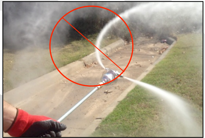
COMPETITORS HEAD RUNNING 3000 R.P.M. SPRAY REACH APPROX. 12" FROM SPRAY TIP

SEE DEMO VIDEO AT WWW.DRIPLOC.COM SELECT "STINGER DUCT CLEANER" IN MENU