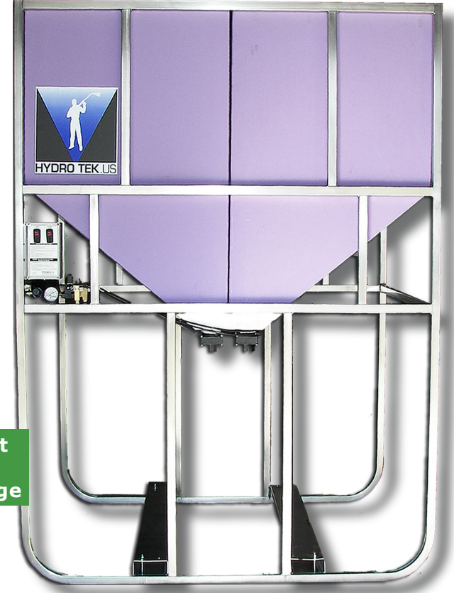
shown with stainless frame option